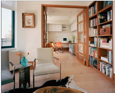
Completed Residential Project Riverside Drive Penthouse